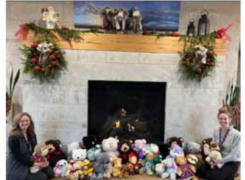
Waterloo Knights of Columbus Council 5135 donated stuffed toys to our Legacy of Love projects