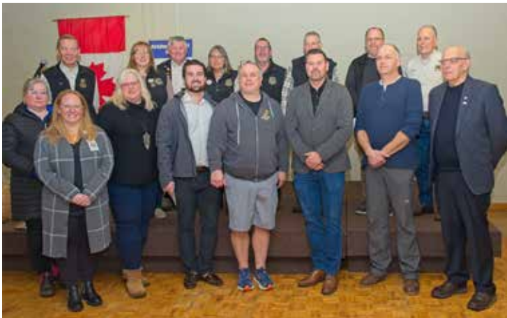
The Paradise Lake & District Lions Club – donated proceeds from their Tuesday night Bingo