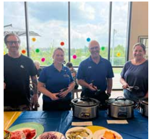
Kitchener-Conestoga Rotary Club – supported refreshment cart service and fun food days in The Cook Family Residence