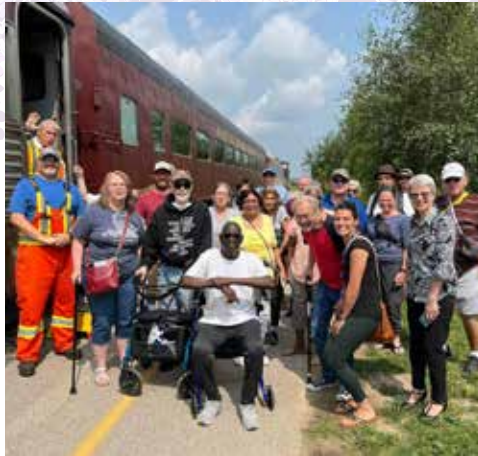
Waterloo Central Railway – provided a unique excursion for our Day Program participants