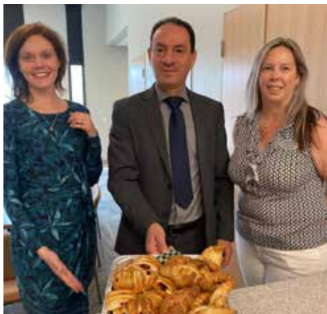
Homewood Suites by Hilton Waterloo/St. Jacobs – provided a monthly breakfast and hot lunch for the day program in Waterloo.