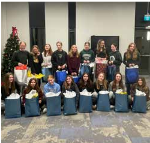
Waterloo Ravens Girls Hockey Association – donated time and supplies for the holiday gift baskets given to day program and community clients