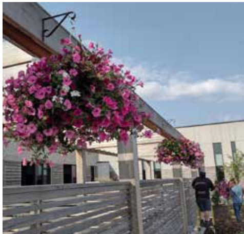
City of Waterloo – Provided hanging flower baskets for each patio suite in the residence