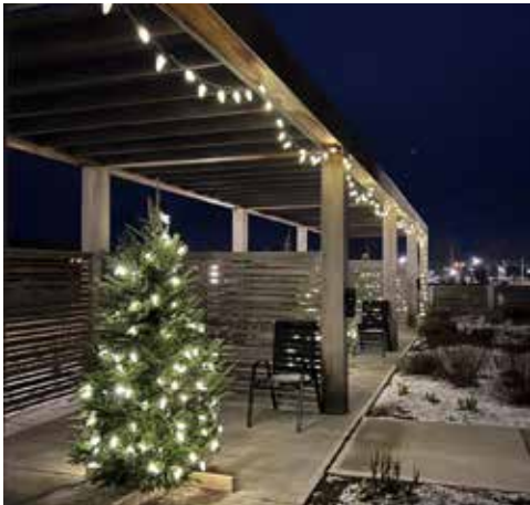
Benjamin Tree Farm & Swanson's Home Hardware – Donated trees and outdoor lighting for our Lights of Love Holiday event and displays outside of each resident room

We are grateful to the many groups and organizations in our community that hold events, donate their time and gifts in kind, or raise funds for Hospice Waterloo Region. We thank you for your support over the past year!