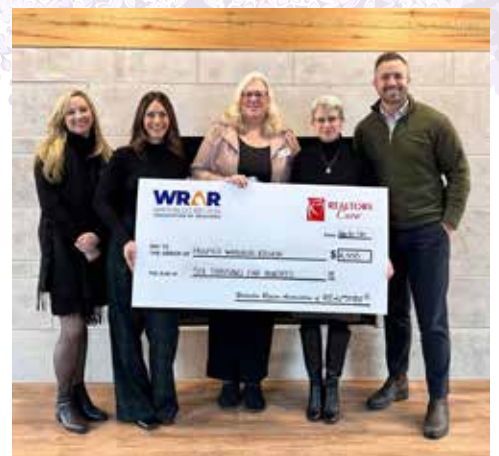
Waterloo Region Association of Realtors – Provided annual support through a generous grant