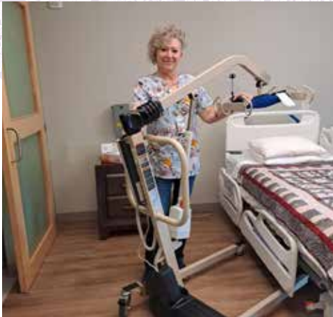
The Rotary Club of Kitchener-Westmount – purchased a new patient power lift for the residence