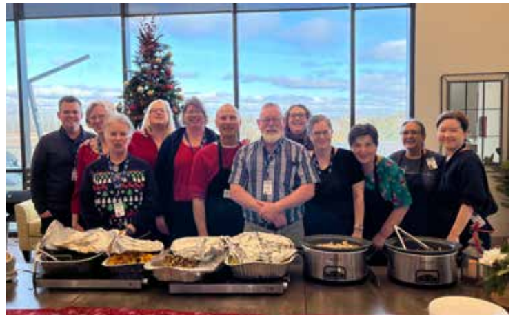
Great Lakes Poultry donated Christmas turkeys for holiday celebrations in the residence